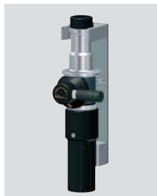
TK16 CNG with mounting